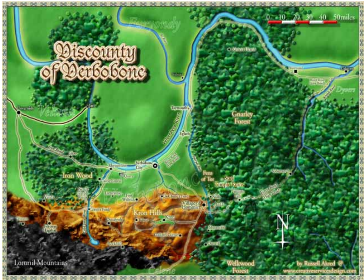
Map 1: The Viscounty of Verbobonc